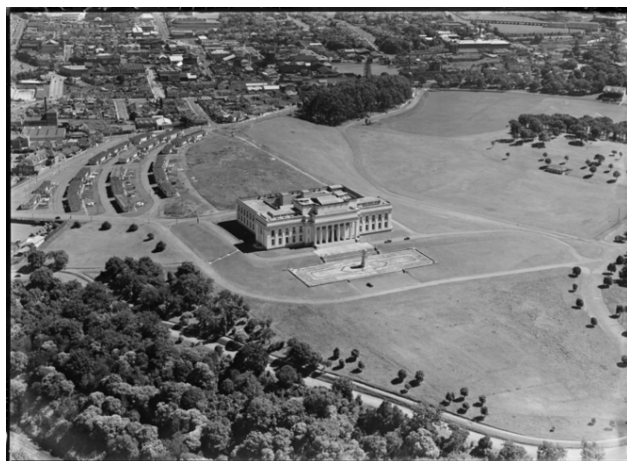
1947 Auckland Museum and War Memorial. Whites Aviation Ltd: Photographs. Ref: WA-11626-G. Alexander Turnbull Library, Wellington

(Shirin Caldwell) – 6 spaces available with bids starting at $25 pp